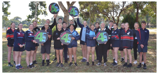
Live4Life Southern Grampians Crew, Crew Induction Day 2023

The crew induction day and Launch were supported through funding by the Australian Drug Foundation and the support of the Southern Grampians Live4Life School and Community Partnership Group.