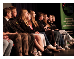
On stage with the Live4Life Southern Grampians Crew, Crew Launch Day 2023