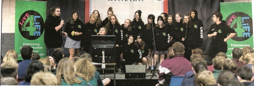
Macedon Ranges Live4Life Crew, youth officers and students at a Macedon Ranges Live4Life celebration event in Kyneton in October 2019.

Live4Life, the only youth mental health and suicide prevention model designed specifically for rural communities, has received outstanding validation in an independent two-year evaluation.