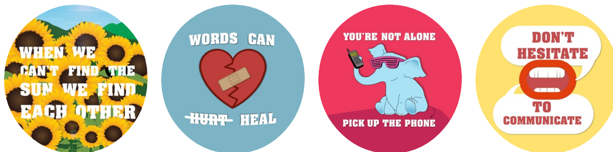
Community themes developed by young people during 2020

We were also encouraged to see that the Victorian Government show confidence in both the Live4Life model and Youth Live4Life as an organisation by financially supporting our work in Benalla and Glenelg during the year.